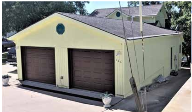
Check out one of our recent exteriors, 10 Clipper Drive.